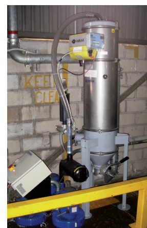
▲ Labotek central vacuum station with central self purifying filter