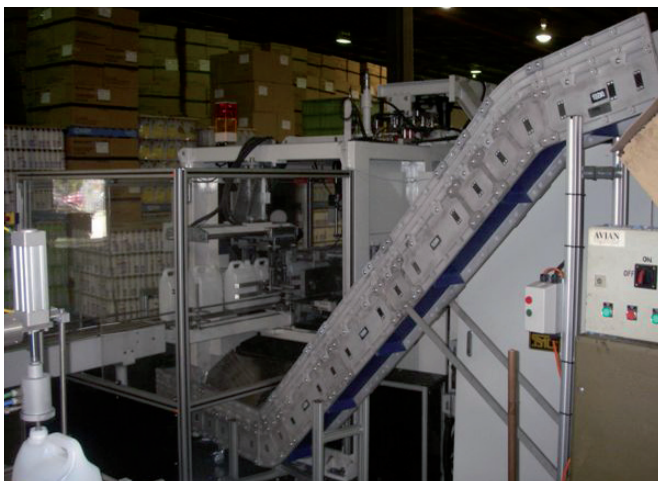
▲ DynaCon modular conveyors are standard on all machines for tops & tails take out to granulator