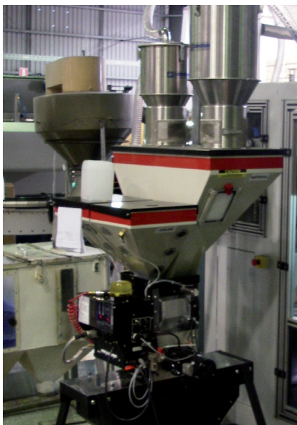
▲ Maguire blender mounted with Labotek SVR vacuum receivers for automatic feeding by the central system