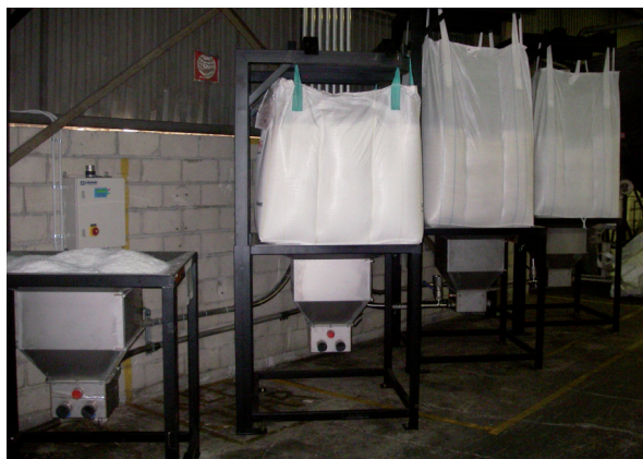
▲ Labotek 1t adjustable bulk bag stands