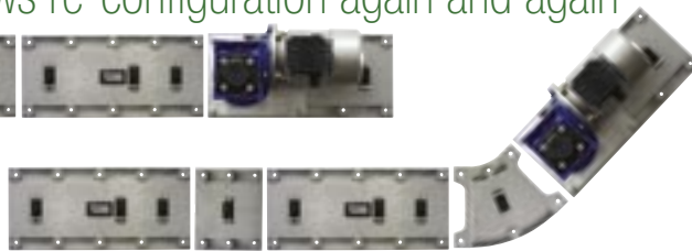
Sample configuration 2