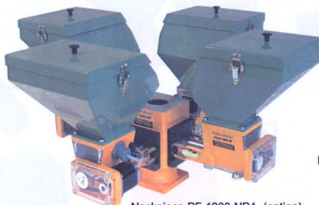
Neckpiece PF 1200 NP4 (option)