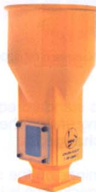
PF 1200 NP2