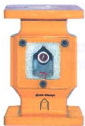
CE 1100 NP2