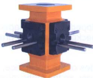
CE 1100 NP4