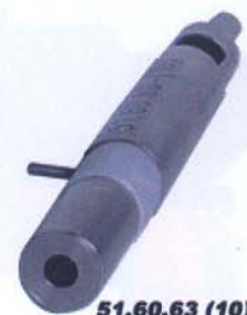
Inside Helix dosing system (option)

The Color-Exact 1100 NP2 neckpiece is as standard equipped with roofshaped „ quick-change “. It is now possible to take off the dosing unit off the neckpiece, without granules are pouring out – a great advantage by color change .