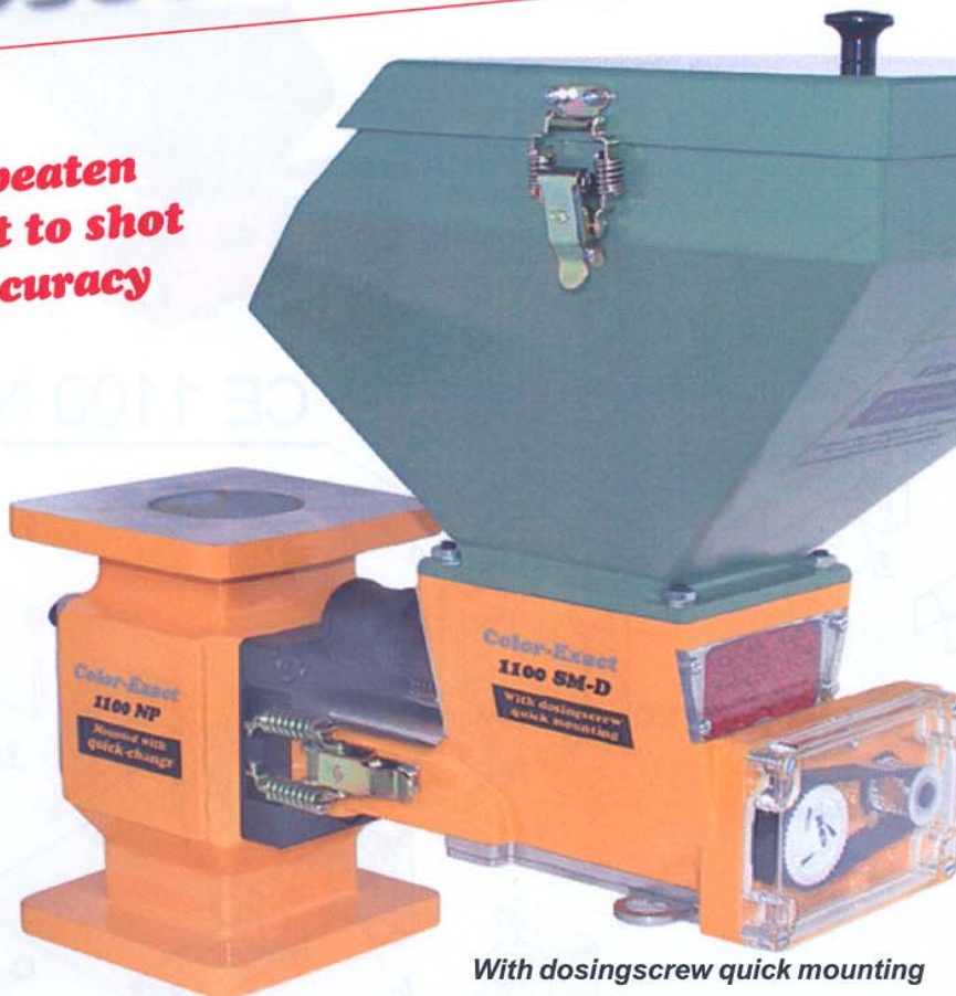
With dosingscrew quick mounting